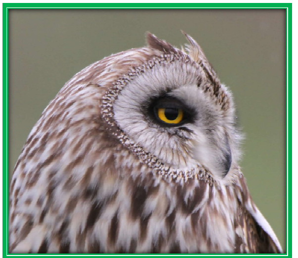
Short-eared Owl

The Outer Banks are separated from the mainland by immense bays. Here the warm waters of the Atlantic Ocean, fueled by the not-too-distant, warm offshore Gulf Stream allows both water and air temperatures on this chain of sandy barrier islands to moderate the winter climate here and on the inner banks. The OBX area is a natural magnet for wintering birds. Over-wintering waterfowl find the area ideal as feeding opportunity abounds. Wading birds and passerines, too, arrive for brief stop-overs or over-winter. Yes, these barrier islands' relatively warm conditions provide habitat niches that allow migrating birds to linger, some remaining as they find the area has sources of fuel to survive the winter months. Air temperatures on the NC barrier islands in winter