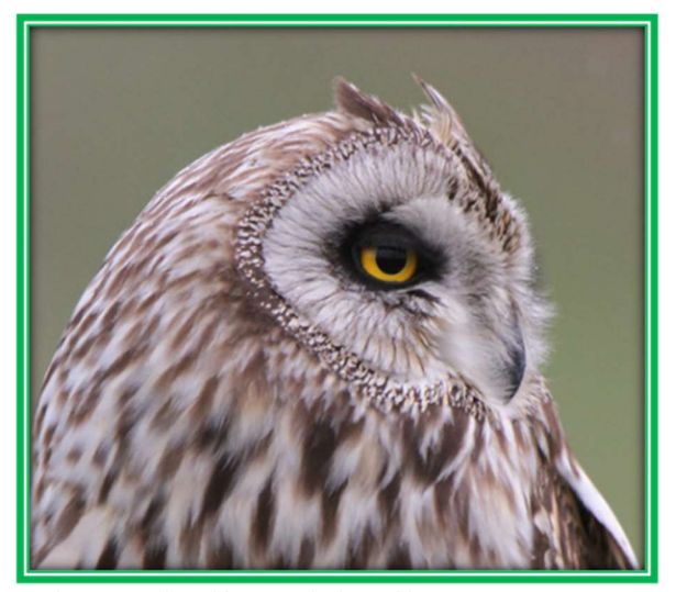
Short-eared Owl

<u>Host Hotel-Comfort Inn on the Ocean, 1601 S Virginia Dare Trail, NC 27948 (reservations: 252-441-6333)</u> Check-in time 4pm, Check-out no later than 11:00am