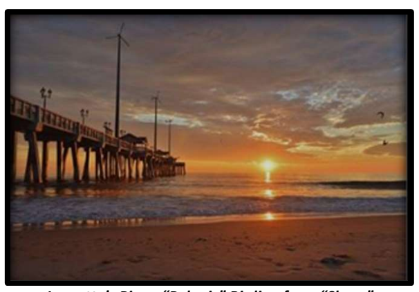
Jennette's Pier - "Pelagic" Birding from "Shore"

The <u>Comfort Inn on the Ocean</u> will be CBC headquarters for the meeting. This Inn boasts amenities that include private balconies, in-room refrigerator and microwave. Go to <a href="https://www.choicehotels.com/north-carolina/kill-devil-hills/comfort-inn-hotels">https://www.choicehotels.com/north-carolina/kill-devil-hills/comfort-inn-hotels</a> for more information about the welcoming hotel.