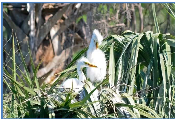
Great Egret nestlings at Seabrook Island, Charleston County, South Carolina, 26 April 2024