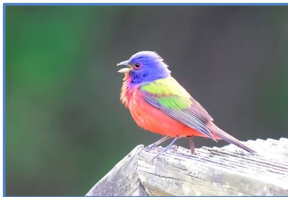
Male Painted Bunting at the Observation Tower, Santee National Wildlife Refuge, Bluff Unit, Clarendon County, South Carolina, 27 April 2024