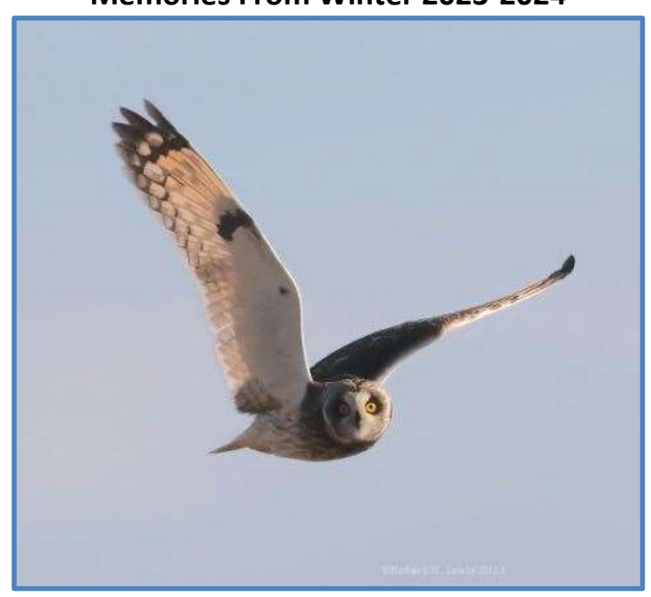
Short-eared Owl at Guilford County Farm, North Carolina, 29 December 2023.