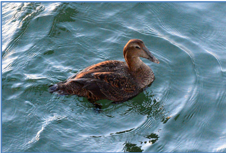
Common Eider is a possibility from Jennette's Pier at Nags Head.

Hotel Returns: Morning trips should be back to the hotel by noon; afternoon and all-day trips by 5:00 p.m.